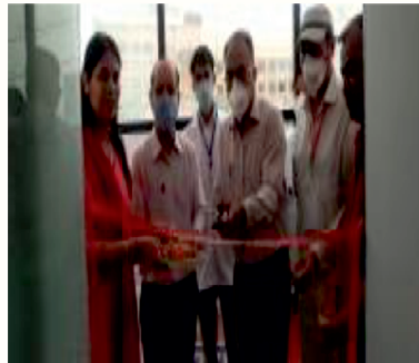
New KDIMS Branch Opening by CMO, Gzb.