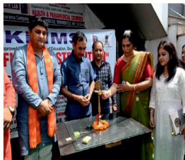
Lamp Lighting Celebration